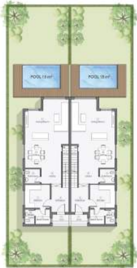
KALA Twin House Ground Floor BUA: 255 m2