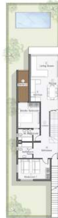
SILA Chalet First Floor BUA: 190 m 2