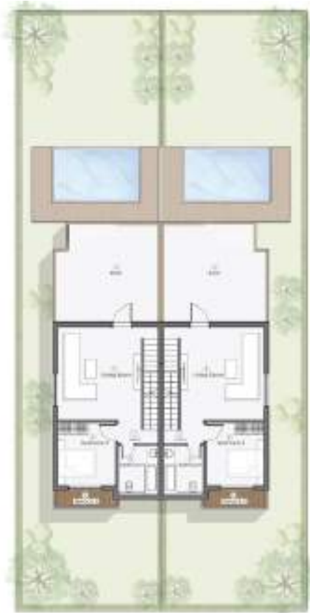
KALA Twin House Second Floor BUA: 255 m2