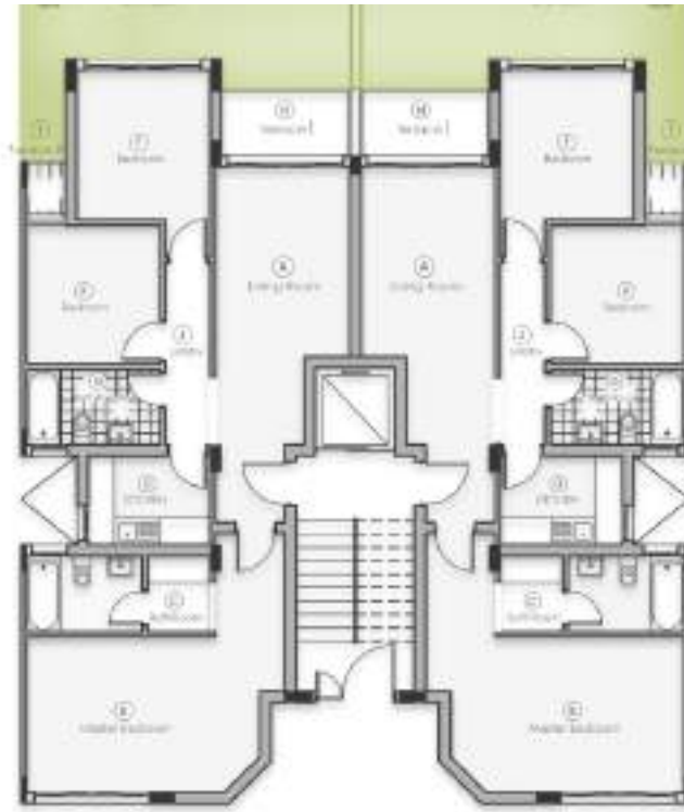
PALMA 3 Bedrooms Chalet Ground Floor BUA: 125 m 2