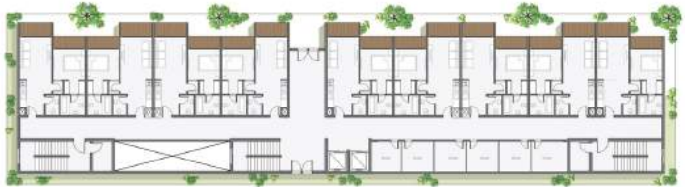
Whole Building B