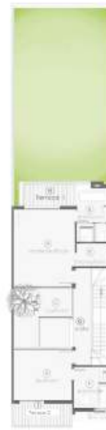
SILA Town House First Floor BUA: 278 m 2