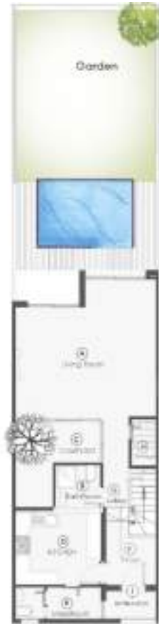
SILA Town House Ground Floor BUA: 278 m 2