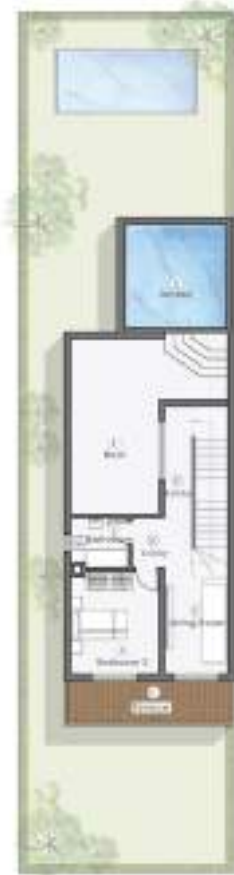
SILA Chalet Second Floor BUA: 190 m 2