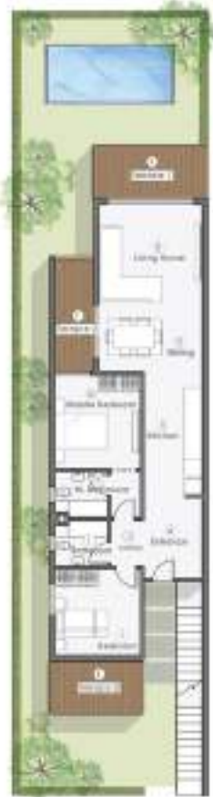
SILA Chalet Ground Floor BUA: 190 m 2