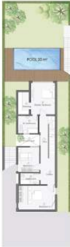
KALA Stand Alone Ground Floor BUA: 310 m 2