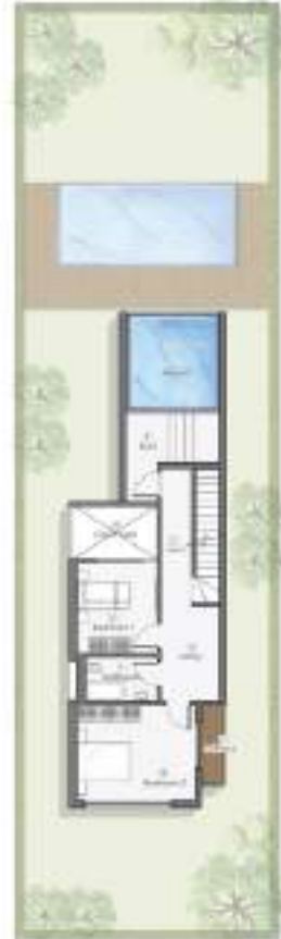
KALA Stand Alone Second Floor BUA: 310 m 2