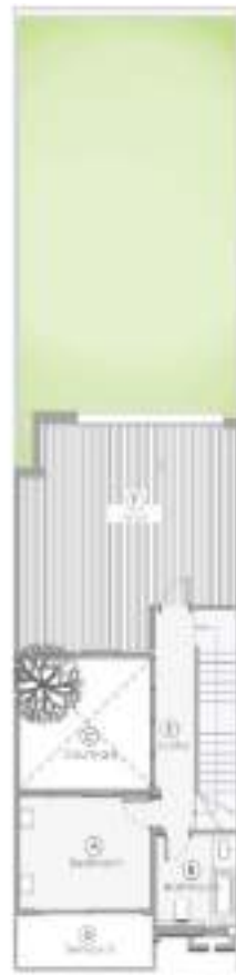
SILA Town House Second Floor BUA: 278 m 2