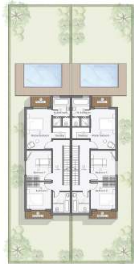
KALA Twin House First Floor BUA: 255 m2