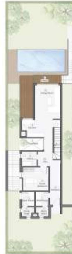
KALA Stand Alone First Floor BUA: 310 m 2