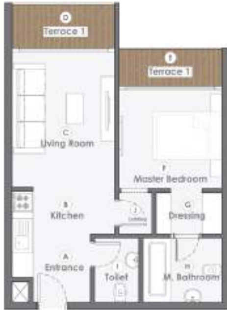
Building B Sila Typical Floor BUA: 75 m 2