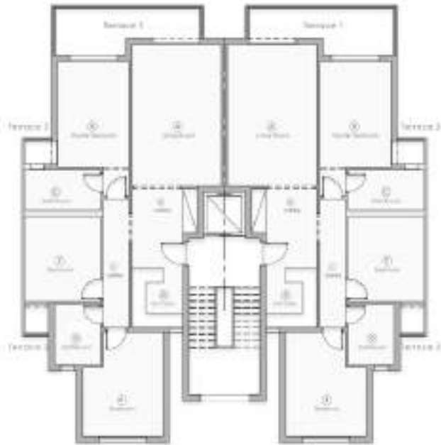
OKILA 3 Bedrooms Chalet Typical Floor BUA: 150 m 2